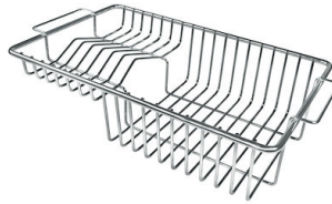
Stainless steel plate rack 8100 201