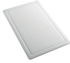
HDPE Chopping board 8657 001